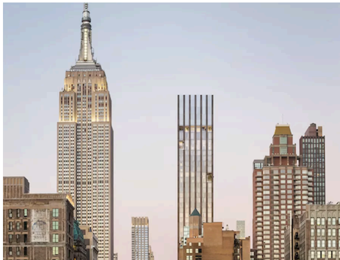
Rafael Viñoly's 277 Fifth Avenue.